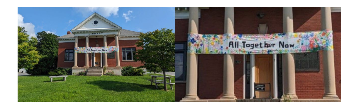
Pictured: Morristown Centennial Library's All Together Now banner, created by children in the summer reading program

Projects for both the Vermont Community Broadband Board and the Vermont Department of Libraries are in the preliminary stages with no expenditures to date for either project. Although no funds were expended, critical work is taking place that builds the foundation for the programs and provides information on how to successfully deploy grants. It is anticipated that deployment of funds will accelerate significantly in the coming year as grant recipients are identified and funds are fully awarded.