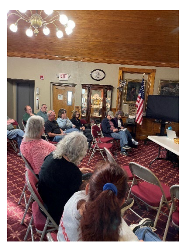
Newport, VT Listening Session

The VCBB offered real-time opportunities for the public to provide feedback and ask questions about strategic plans and their impact on all Vermonters. The VCBB hosted two virtual listening sessions via Zoom and six in-person listening sessions in communities across Vermont. Based on current broadband availability and adoption data for the State of Vermont, event locations were chosen proximate to areas with the lowest rates of broadband availability and adoption, while also balancing with the need to have geographic breadth across the state. Event locations were also chosen to ensure easy access to major roads and highways wherever possible, to increase the likelihood of participation for those not from the immediately surrounding region. The events were held most frequently in the evenings, to avoid conflicting with work commitments, with one virtual